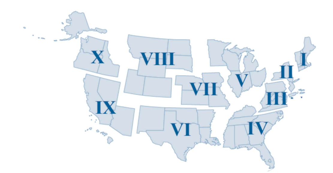
Figure 2: Public Power Utilities Mutual Aid Regions<sup>23</sup>

The mutual aid roles and responsibilities for public power utilities are defined at the local/state, regional, and national levels. Level 2 and 3 events, which are at the local/state or regional levels, involve utility and network coordinators. A level 4 event, which is on a national level, involves the utility coordinator, network coordinator, and APPA serving as national coordinator. For a national level event, APPA works with network coordinators from the following affected industry associations: EEI, the National Rural Electric Cooperative Association, the trade association for the cooperative electric utilities, and other organizations such as the National Emergency Management Association.<sup>24</sup>